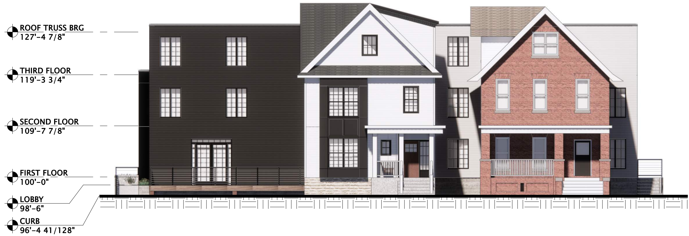
SOUTH ELEVATION - MIFFLIN 3/32" = 1'-0"