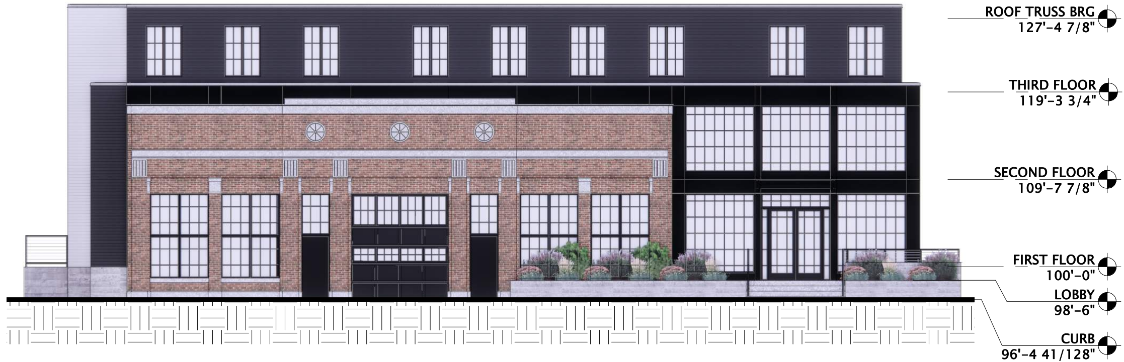
NORTH ELEVATION - DAYTON 3/32" = 1'-0"