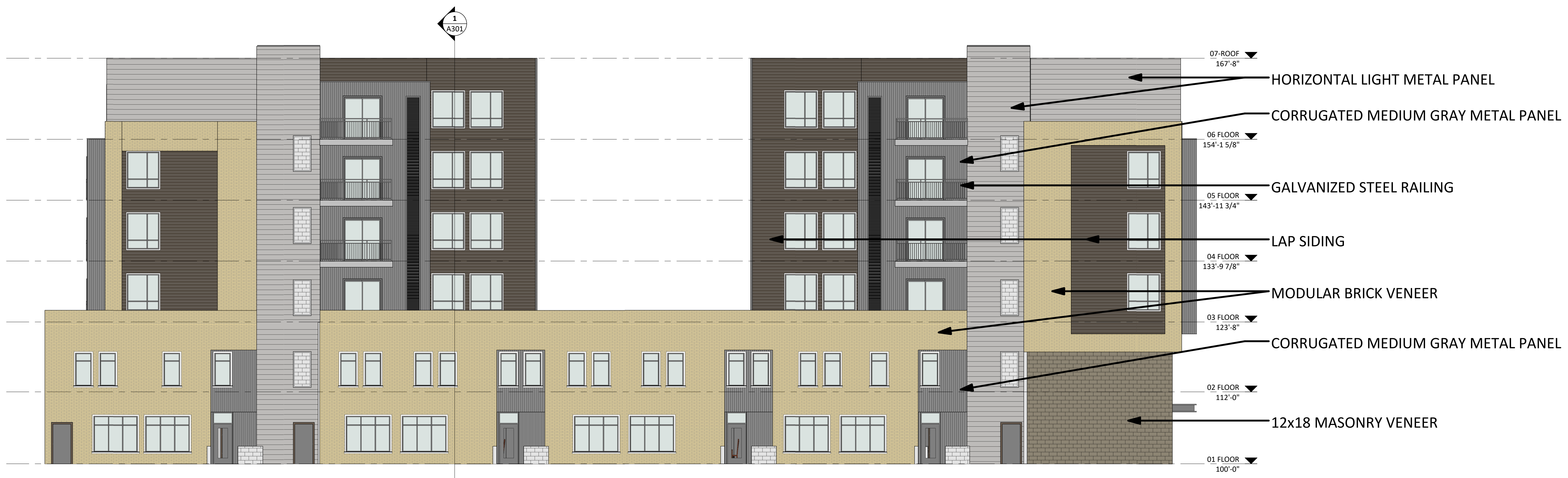
1 NORTH ELEVATION SCALE: 1/8" = 1'-0"