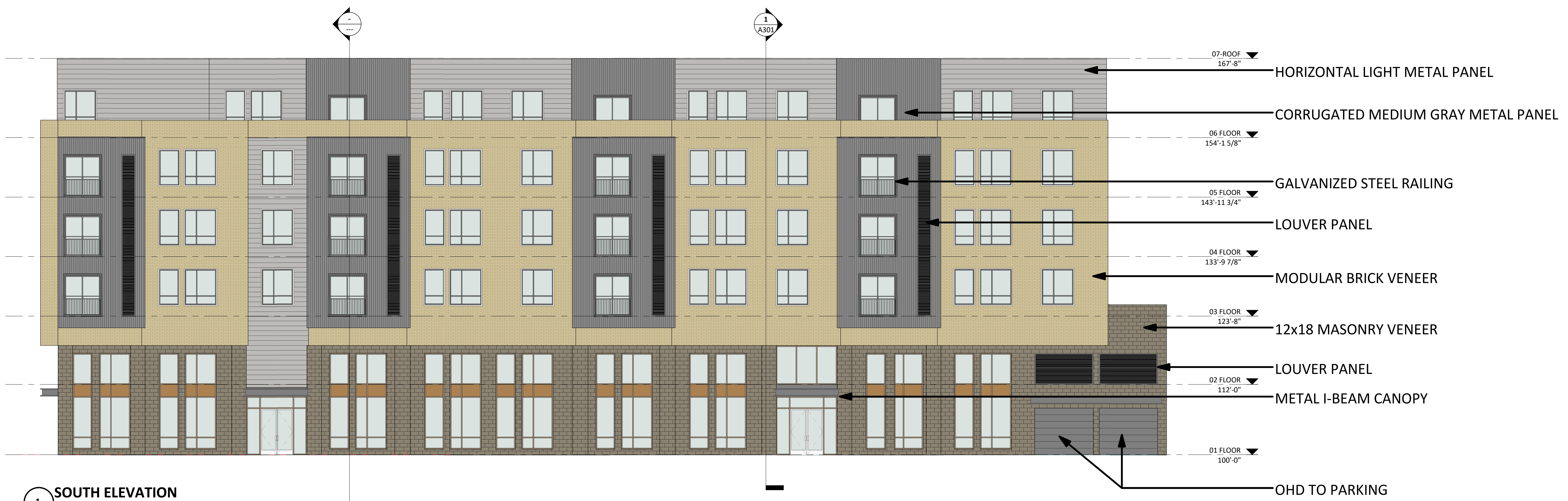
1 SOUTH ELEVATION SCALE: 1/8" = 1'-0"