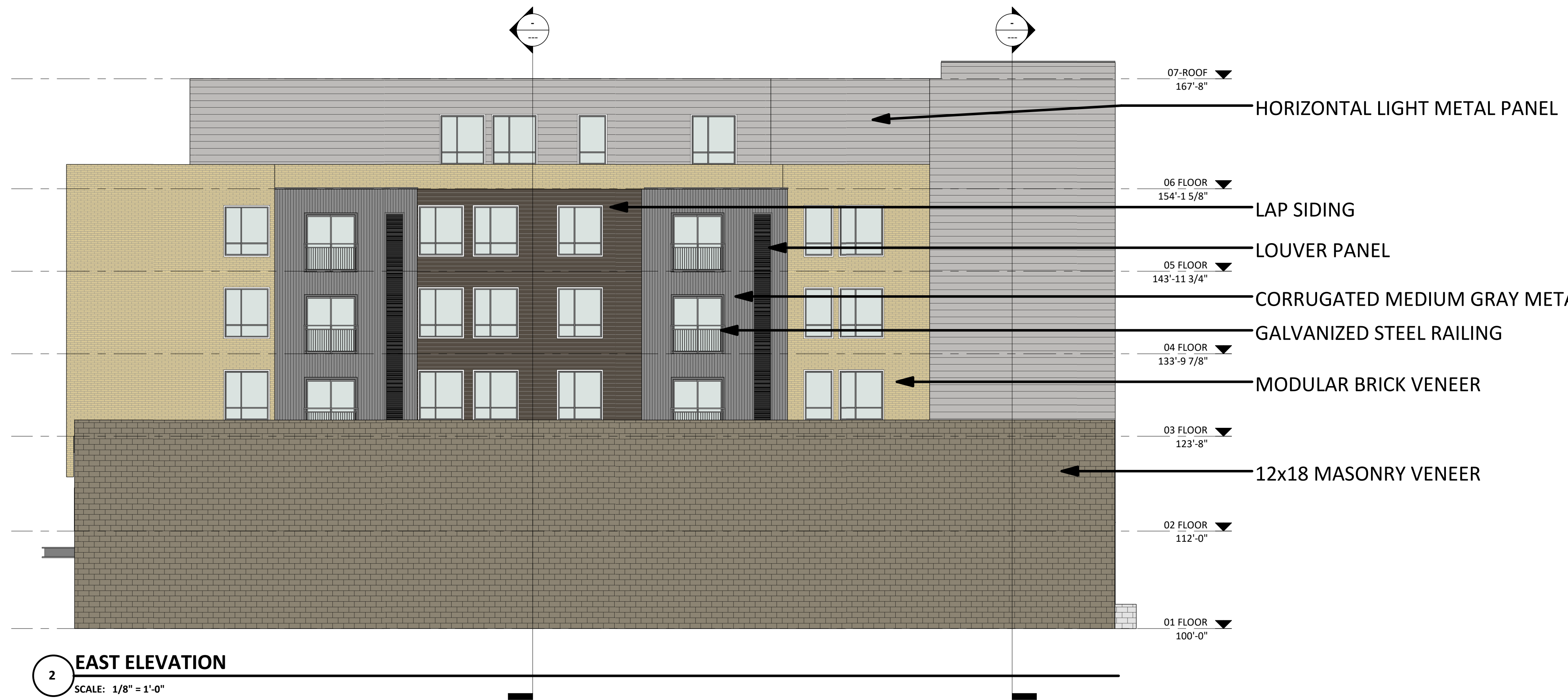
2 EAST ELEVATION SCALE: 1/8" = 1'-0"